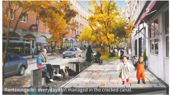
Rantzausgade - everyday rain managed in the cracked canal.