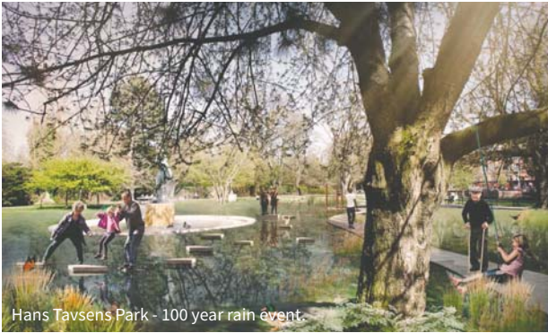
Hans Tavsens Park - 100 year rain event.