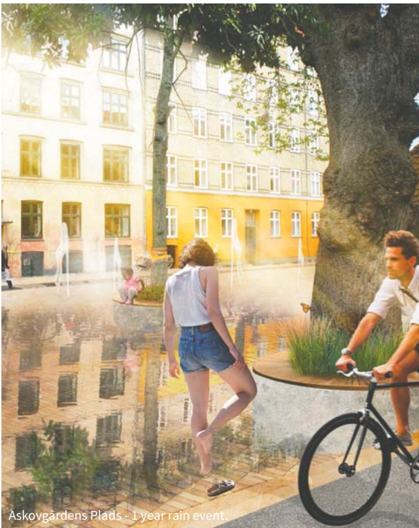
Askovgårdens Plads - 1 year rain event.

A sensorial & green Inner Nørrebro MSc04 URB 02