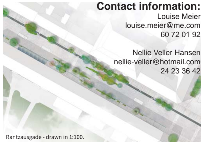
Rantzausgade - drawn in 1:100.