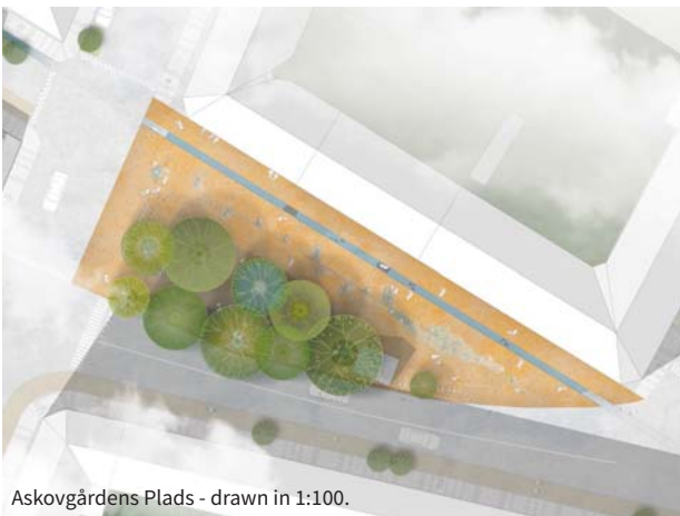
Askovgårdens Plads - drawn in 1:100.

A storm water strategy conceptually provide a solution and three points of impact make design choices for Hans Tavsens Park next to Assistens Kirkegården, Rantzausgade and Askovgårdens Plads located in Korsgade. The designs create great places to live containing many layers that, adds to the basic function of an urban space, and turn storm water into a resource accentuating space differently. By strengthening life on foot, a large number of valuable social and recreational possibilities are brought into play. A change of the daily bustle is reflected in different experiences at daytime and at nighttime. Light effects and a variation of grown environments are staged to create an experience of investigation, astonishment, and wonder.